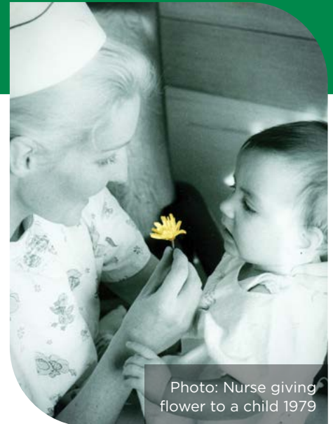
Photo: Nurse giving flower to a child 1979

A gift in your Will is a profound and lasting contribution. It serves as a testament to your values and leaves a legacy that extends far beyond your lifetime.